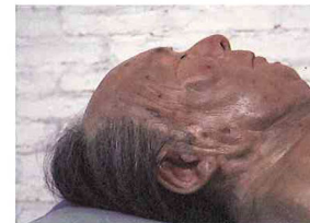
Right: Shen Shaomin, Summit (detail), 2010, silica gel simulation, acrylic, fabric, installation view at Sydney Biennale.

Setting the scene, we find ourselves in the popular arena of this eclectic global awakening. Here is where The Beauty of Distance narrates the story of contemporary art's reconciliation with an estranged and obscure relative, known by some as "global art." In the search for