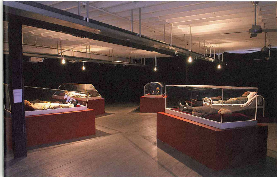
Top: Shen Shaomin, Summit , 2010, silica gel simulation, acrylic, fabric, installation view at Sydney Biennale. Presentation made possible with support of Osage Art Foundation, Hong Kong.

The resonance of this proclamation by David Elliott was to summarize the drive of the biennale, taking aim at the grand unifying theories harking back to the Enlightenment that have prevailed in Western civilization over the past centuries. Here they are emphatically rejected, along with today's flailing discourse of the modernist ideal, undermined by the antithesis embodied in globalism. In turn, we make introductions between the prevailing dimension of contemporary art and its alter-ego of "global art." 6