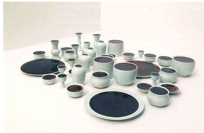
Liu Jianhua, Container Series , 2009, porcelain and glaze, installation view at Art Gallery of New South Wales. Presentation made possible by Beijing Commune, Beijing.

In the end, compromise has undermined Elliott's original claim that the Sydney Biennale exhibited art that was previously marginalized or discounted by modernity. Instead, we see only a clear reflection of the underlying framework we use to understand the phenomenon of globalization. On the other hand, Elliott's vision cannot be judged as a success or failure, as it holds fast to no fundamental criterion other than that of contributing to the global discourse surrounding the future paradigm of global contemporary art.