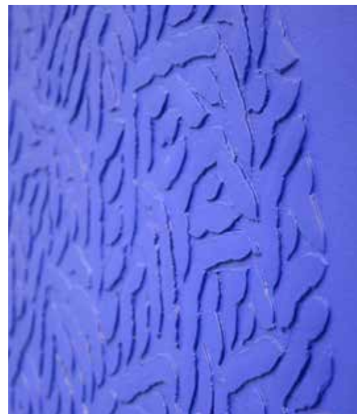
Shen Fan, Shan Shui-C-31 (detail), Oil on canvas, 138 cm x 118 cm, 2004.

On November 29, 2018, Eli Klein Gallery in New York inaugurated a solo exhibition featuring works by Shanghai-based artist Shen Fan – a pioneering figure of abstract painting in China, whose career spans nearly 40 years. Titled Shen Fan: Works in Abstraction 1992–2017 , the exhibition includes a wide range of works that illustrate Shen's ability to combine Western expressionism with Eastern philosophies and traditional Chinese art practices to pave a unique path for contemporary Chinese abstraction. On view till February 16, 2019, the exhibition features twelve works from three important periods in Shen's career from 1992 to 2017: oils on paper from the early 1990s, Shan Shui (Mountain and River) paintings from the early 2000s, as well as three recent acrylics on newspaper from the Punctuation series.