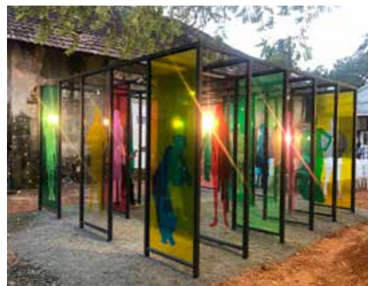
Hashtag#Collective, GenderFluid: identity | material | space, Installation View at Gallery OED, Kochi, December 10, 2018–March 28, 2019.