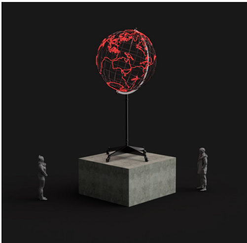
Mona Hatoum, "Hot Spot (stand)"

Starting with the somber, Hatoum's "Hot Spot (stand)" is a metal globe lit with red LED lights to outline conflict zones around the world. But in Hatoum's vision, all continents are included in that category, signaling that conflict spots "are not limited to certain areas of disputed borders."