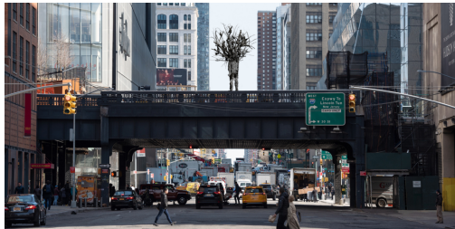
Nick Cave, "A·mal·gam". A proposal for the High Line's public art Plinth commissions

The High Line in New York wants to hear your opinion on 80 proposals for two of its future public art commissions. The public's feedback will have some weight in the shortlisting process, but the final call will still be made by High Line Art, the nonprofit overseeing the elevated park's art exhibits.