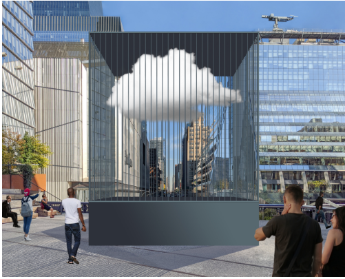
Alfredo Jaar, "When the Music Stops"

Starting with the somber, Hatoum's "Hot Spot (stand)" is a metal globe lit with red LED lights to outline conflict zones around the world. But in Hatoum's vision, all continents are included in that category, signaling that conflict spots "are not limited to certain areas of disputed borders."