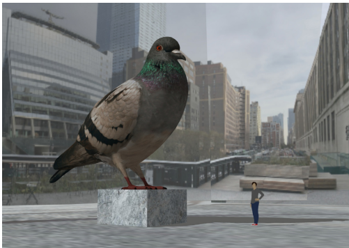
Iván Argote, "Dinosaur"

Bennani's " Bouncy Storm " is an elaborate mechanical contraption wrapped in a yellow compression spring. There's a lot going on in this piece, but its main feature is huge downward-looking binoculars through which you can see "videos of strangers."