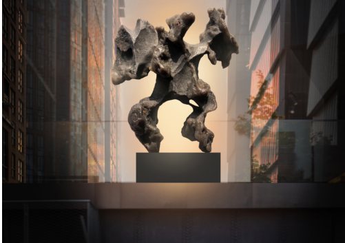
Wang Sishun, "Apocalypse 12.20.18"