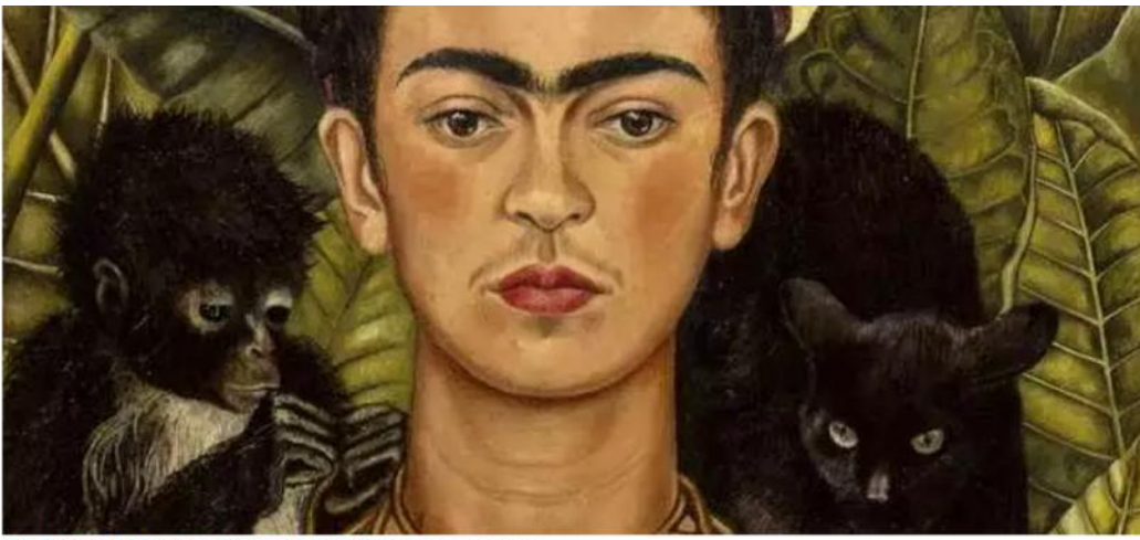
23 Recent Works Of Art That Shook History »