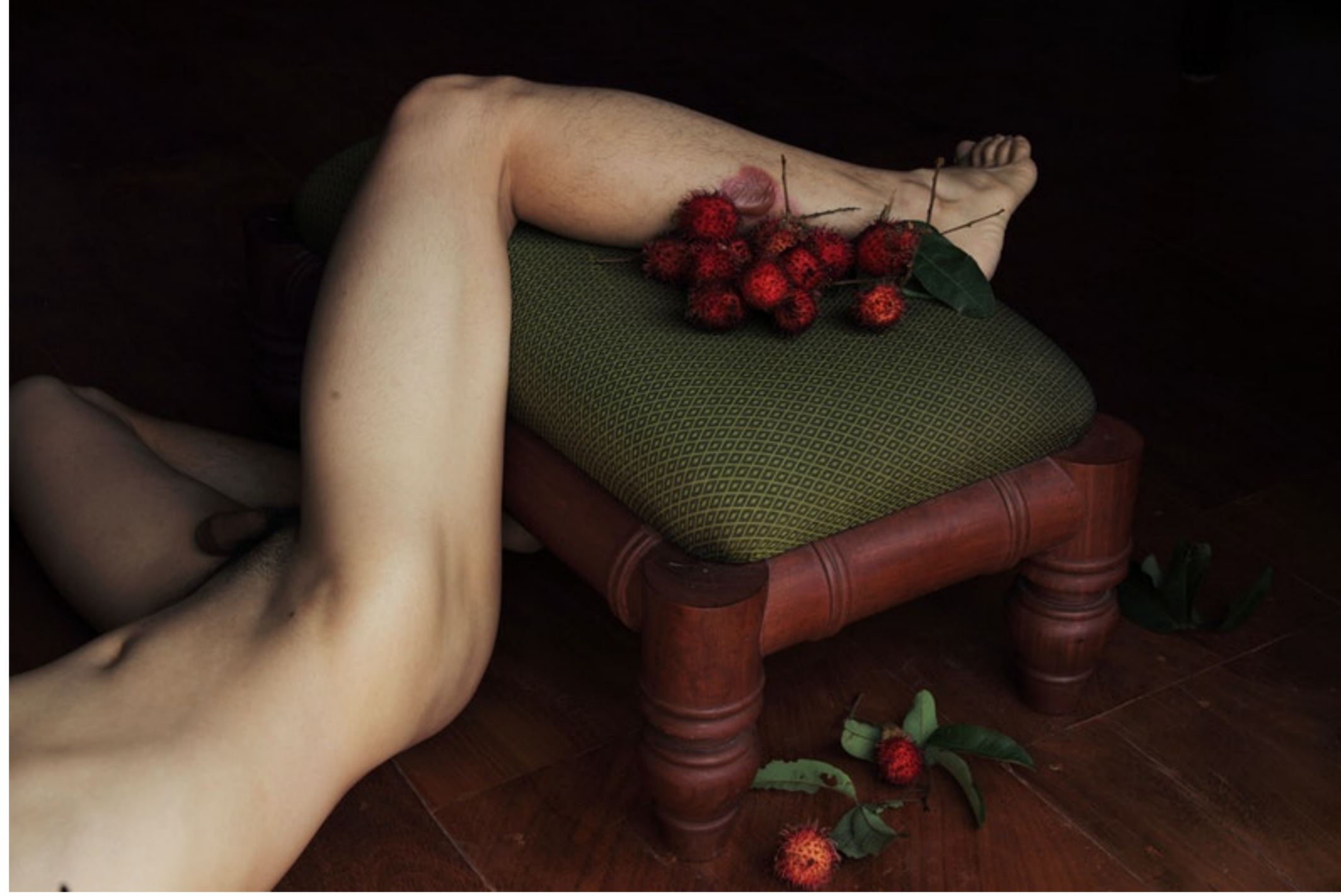
Shen Wei, Self-portrait (Burn) , 2012. C-print, 30 x 45 inches.

The abstract paintings of Feng Lianghong and Shen Chen give visual readings on adjacent walls. In each case, the close spatial relationship of the paintings may suggest they appear altered given their insular positioning—a kind of solidarity that might be understood in Marxist terms. Still, it is unlikely. In past decades, such readings may have been possible, but less so from the perspective of post-Tiananmen Square.