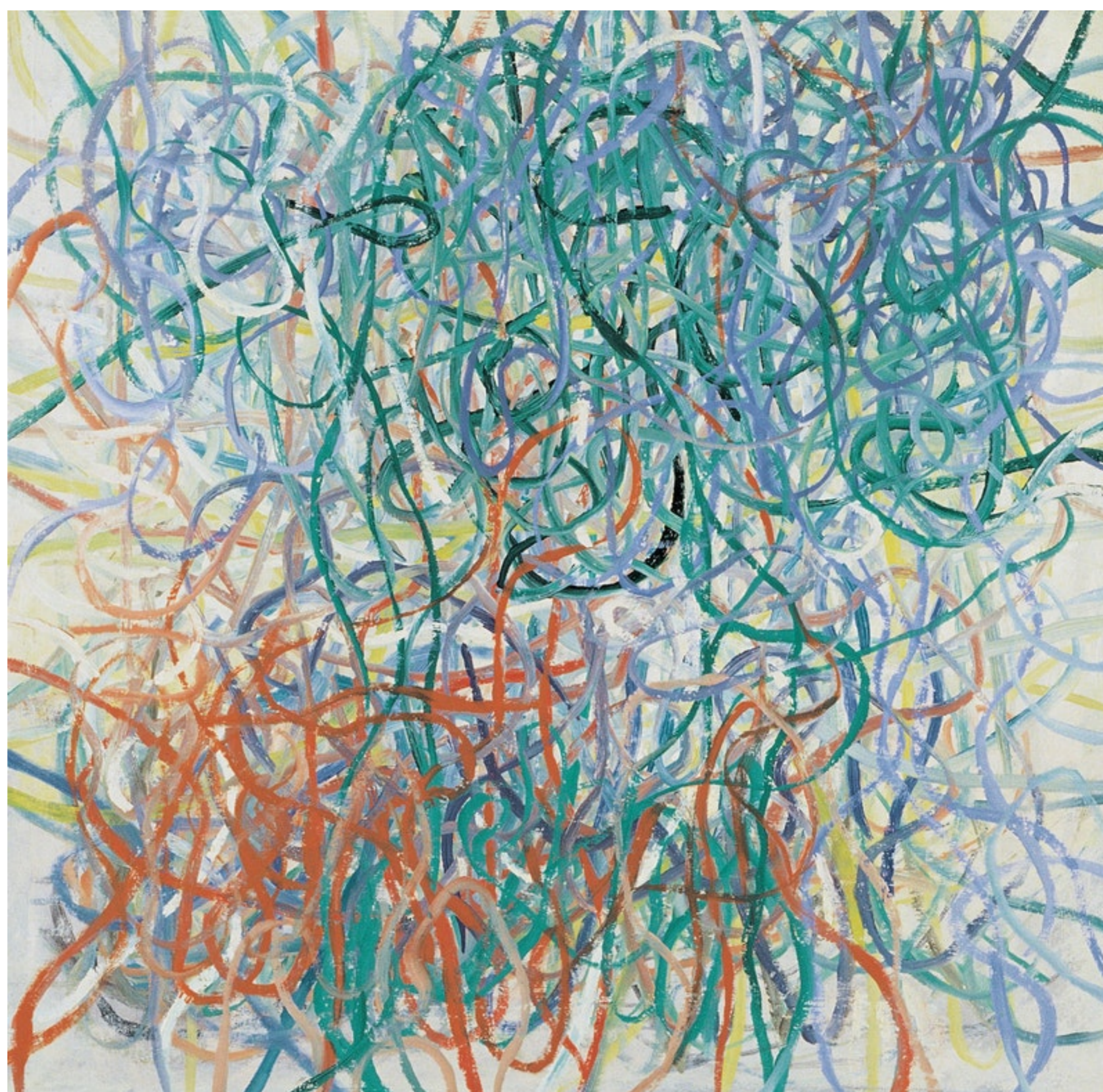
Feng Lianghong, Red and Green No. 92-5, 1992 . Oil on canvas, 32 x 32 inches.

Alienation ? is the title of an exhibition at the Eli Klein Gallery, located on the West Street highway and starkly removed from other gallery outposts that promote avant-garde art in Manhattan. Its isolation undoubtedly informs the immediacy of its attraction. By transforming the single word of the show’s title into a question, the gallery provokes viewers to come to terms with its meaning. For many, the word alienation might read as an overused Marxist epithet, or an allusion to the ideas we could encounter in Camus or Sartre. But despite the title of this exhibition, there are relatively few hardened cases of alienation on display here. Each work appears to have its special place, and each retains a message as to what is meant not only by the presence of the work, but by the questions raised as to the work’s importance. This is a calibrated offering whereby each object or image is made to stand its own ground.