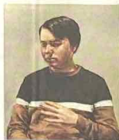
"The Witch" (2021), an oil painting by Michaël Borremans that is in his show at David Zwirner.