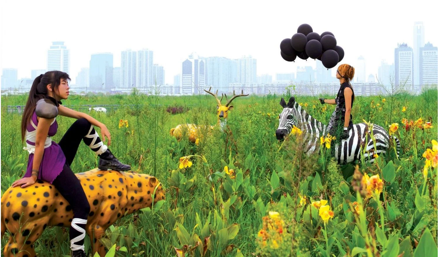
Cao Fei, Cosplayers (2004). Single channel vide, 9'12".

The seventh Guangzhou Triennial will officially open at the Guangdong Museum of Art on 10 February after being delayed by China's spiking Covid-19 cases.