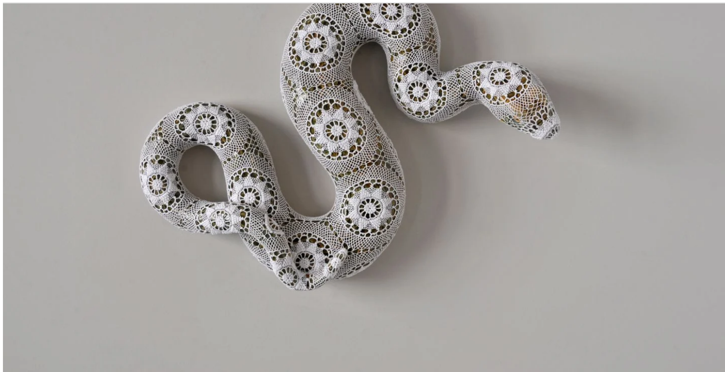
Joana Vasconcelos, White Snake (2015). Rafael Bordalo Pinheiro faience painted with ceramic glaze, Azores crocheted lace. 14 x 50 x 67 cm. Courtesy the artist.

Works by 59 artists—including over a dozen new commissions by artists such as Francis Upritchard , Małgorzata Mirga-Tas , and Wang Lijun —will address notions of change across four thematic sections within the show: 'Bumps on the Edges', 'In Praise of Slow Art', 'Touch Screen / Me', and 'Immanence'.