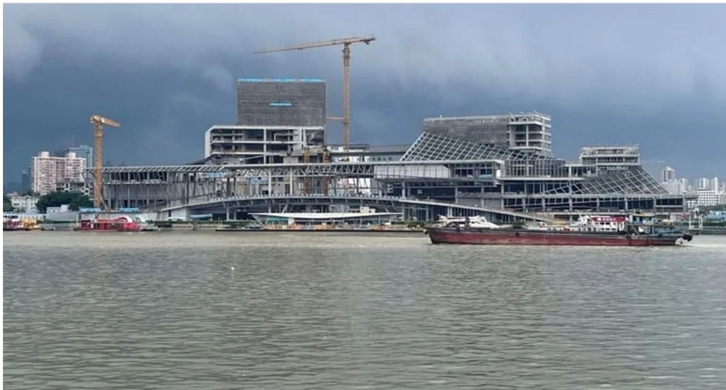
The Bai E Tan Greater Bay Art Centre under construction.

Immanence , meanwhile, draws out the core distinct interweaving threads in contemporary Chinese art through a dialogue with artists such as Hu Jieming , Zhang Xiaogang , and Zhang Ding .