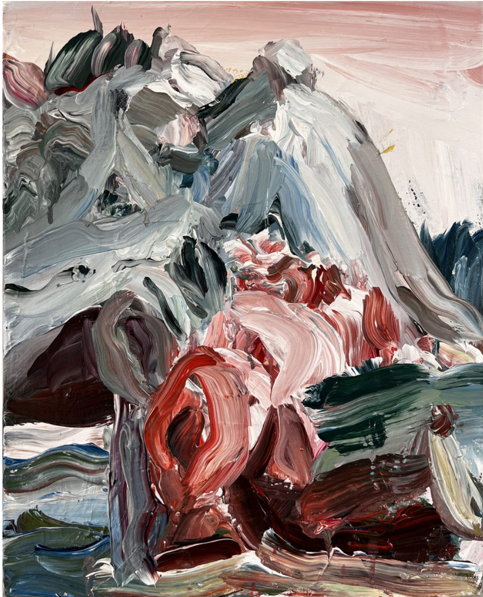
Xiao Kegang, Wood in Forest X (2022).

Chinese artist Xiao Kegang (b. 1968) has developed a practice that explores the boundaries of painting, such as the line between abstraction and figuration, and the effects of light and color. Perspective and its variability are also a key theme in the artist's work; Kegang's painterly and gestural compositions could be understood variably—where one might see a mountainous landscape, another might find a still life. Kegang's current solo exhibition, " Detour (https://www.artnet.com/galleries/eli-klein-gallery/detour) "—the artist's solo debut in the United States—is on view at Eli Klein Gallery through March 25, 2023. Comprising 19 canvases, "Detour" traces Kegang's recent experimentations with painting. Continuing his play with perspective—both formal and illusory—in this series foregrounds and backgrounds become essentially interchangeable.