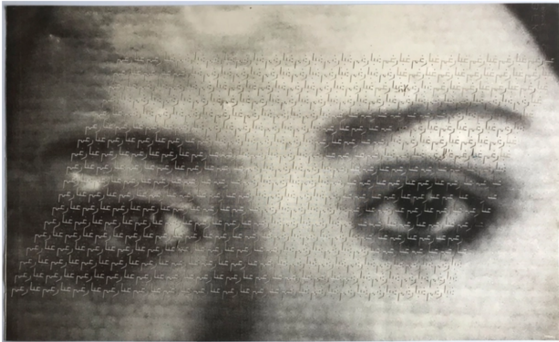
Golnar Adili, Dust of Sorrow (Ghobar e Gham) (2018).

Artnet Gallery Network ( https://news.artnet.com/about/artnet-gallery-network-737 ), February 7, 2023