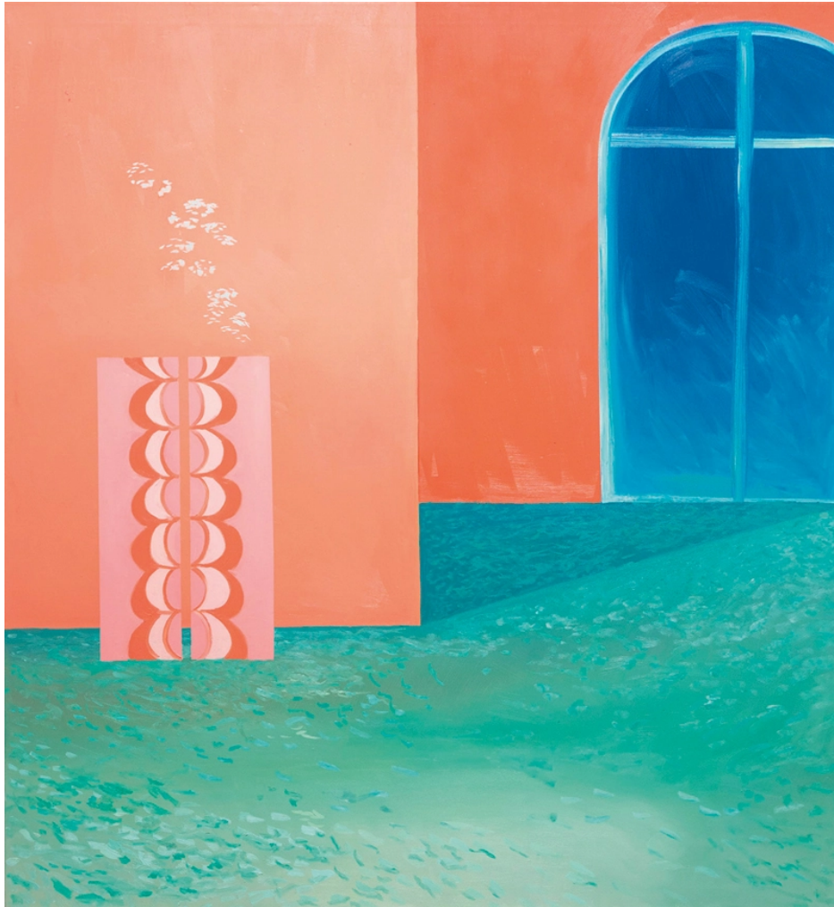
Lucía Tello, Habitación (2021).

Centering on contemporary female stereotypes, the paintings of Lucía Tello (b. 1996) reflect on both personal and societal gender identities and the myriad ways that media capitalizes on these clichés. Originally from Seville, Tello distills the themes, motifs, and symbols that have come to be associated with the feminine and recasts them in her paintings as focus points for reflection on and interrogation of mass media's portrayal of women. By surveying and engaging with a multitude of different sources, Tello seeks a common identity—or, perhaps, irreducible form—which in the context of media representations of women often results in a preposterous fusion of fiction and reality.