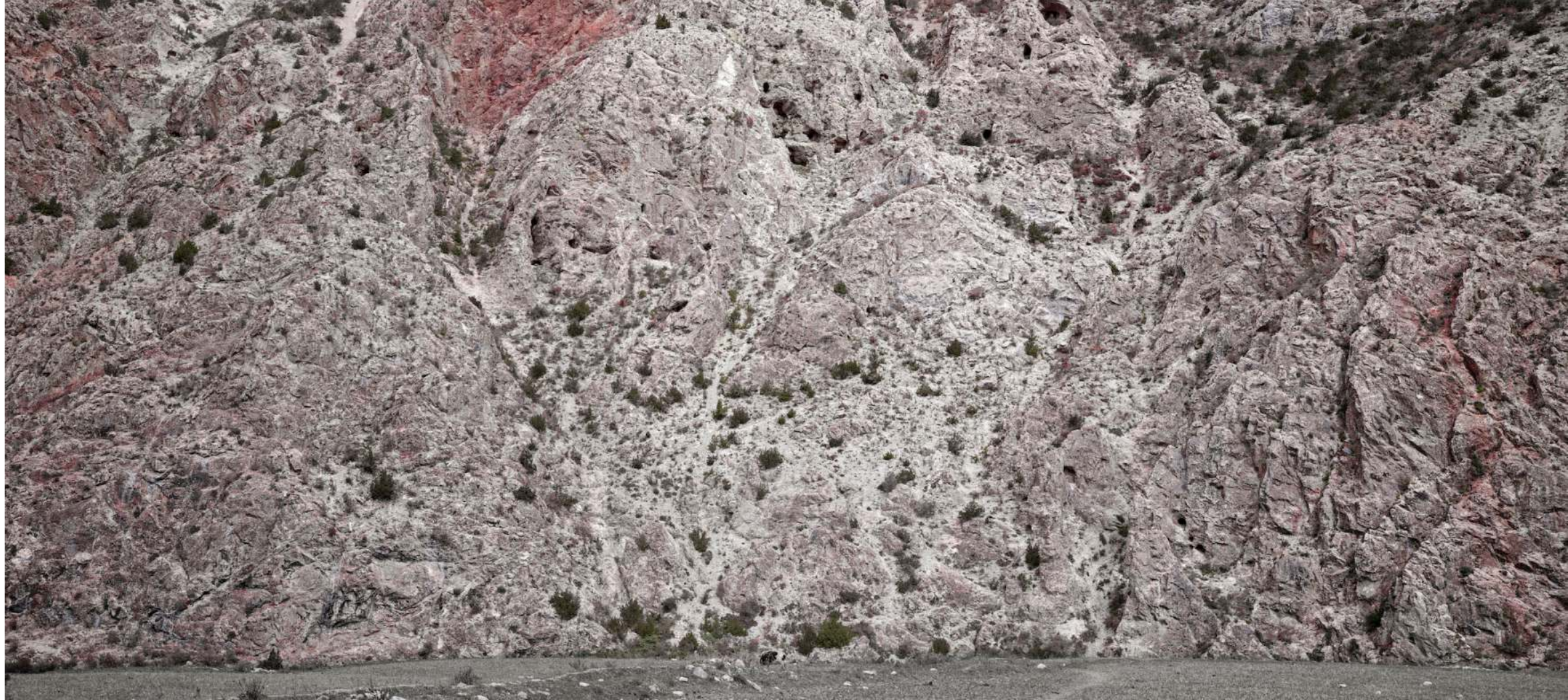
Echo of Shanshui 10, 2021 Archival pigment print 19 5/8 x 39 3/8 inches (50 x 105 cm) Edition of 7