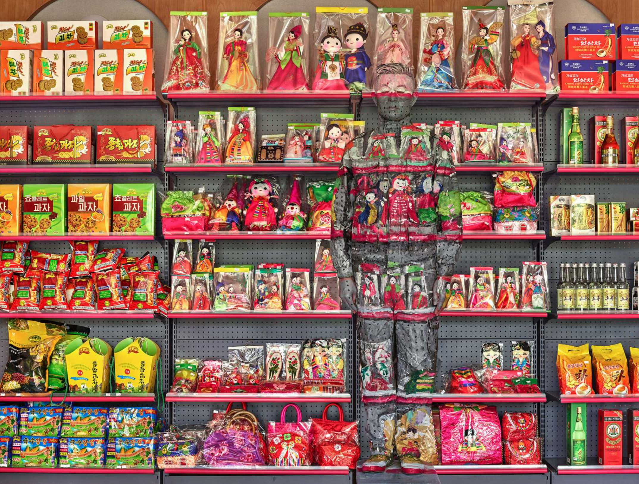
Hiding in North Korea - Supermarket Pyongyang, 2018

Archival pigment print 44 1/4 x 59 inches (113 x 150 cm) Edition of 5