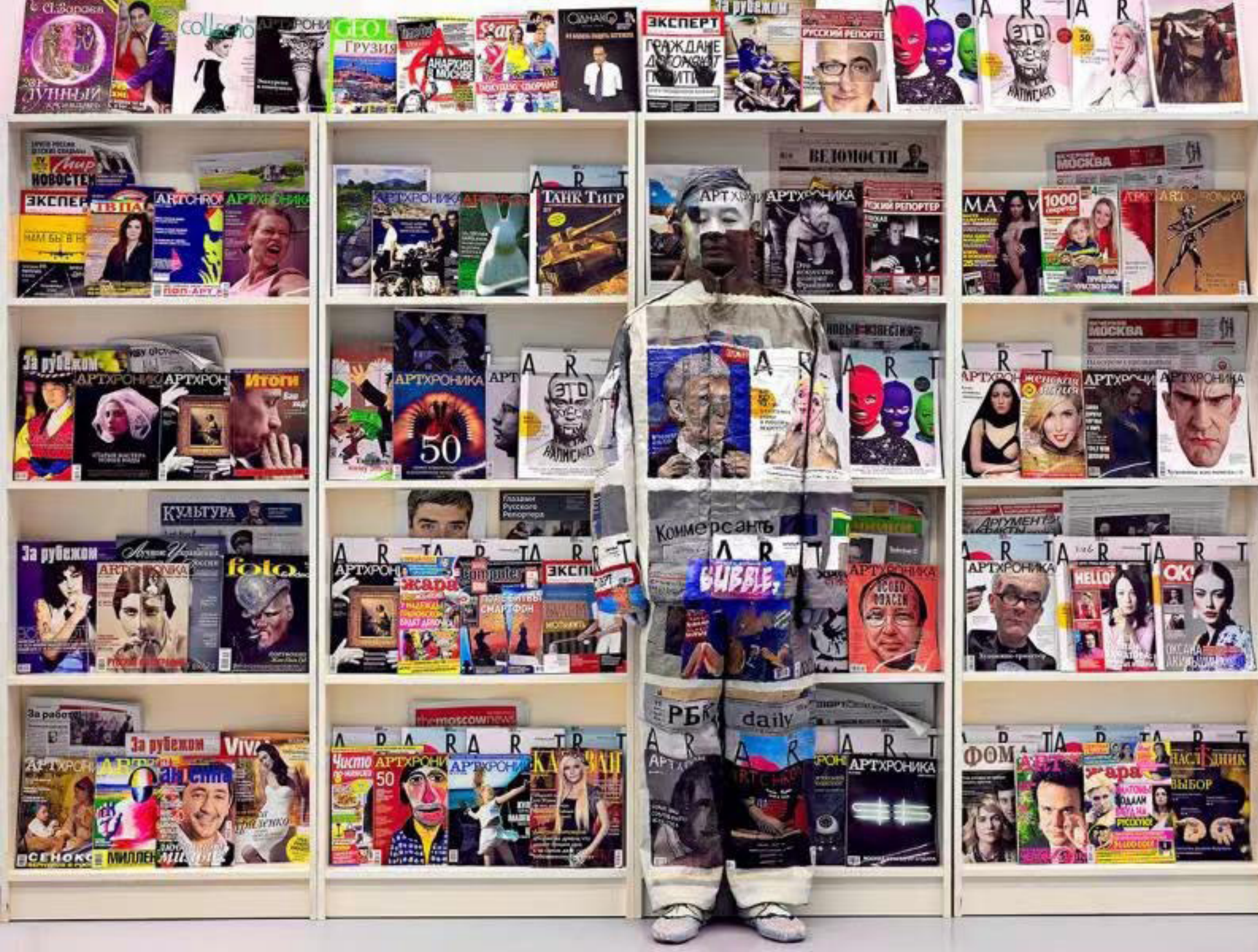
Hiding in Russia - Russia Magazine, 2012 Archival pigment print 44 1/4 x 59 inches (113 x 150 cm) Edition of 6