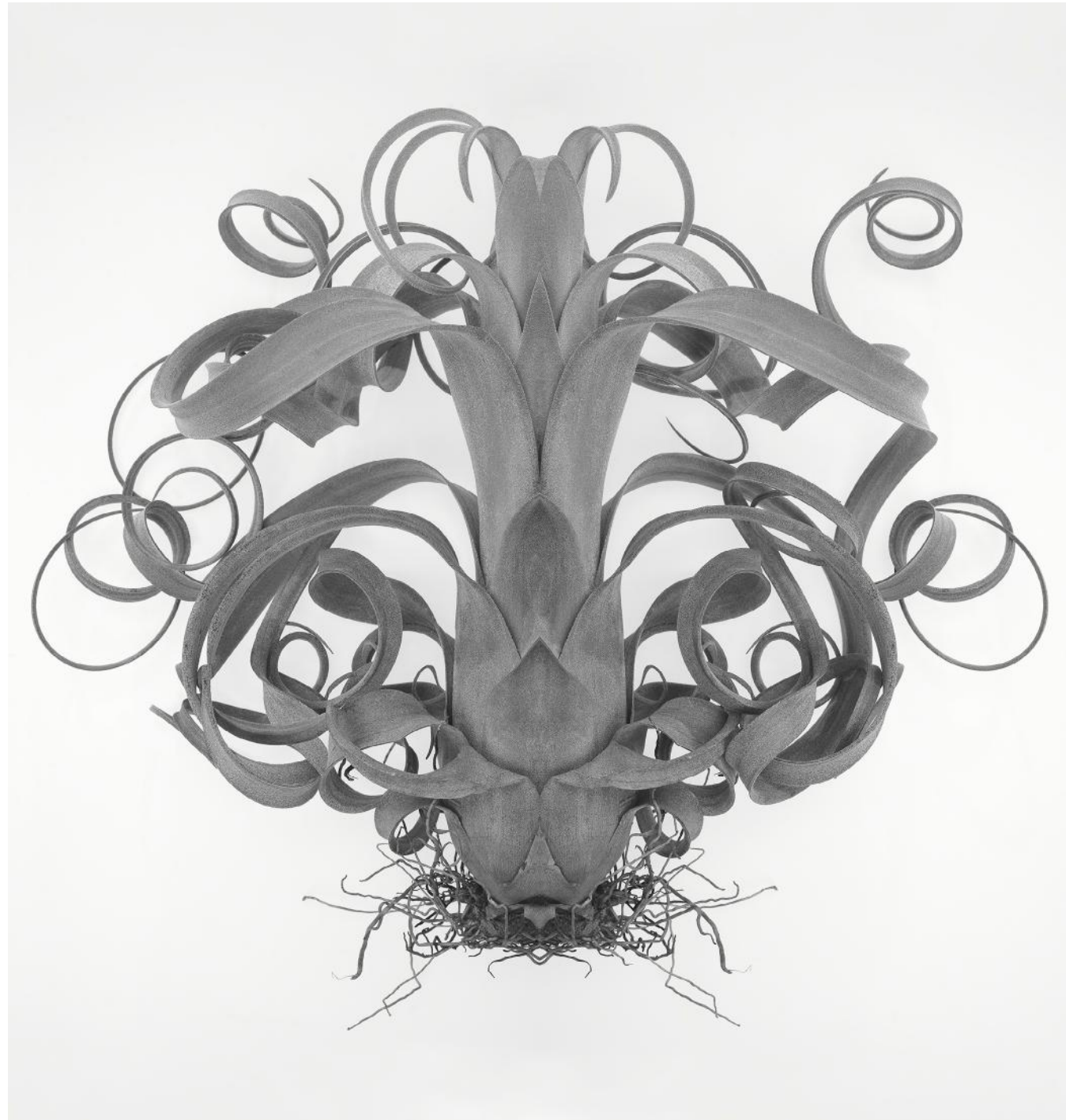
Plant Portrait - Tillandsia 01, 2022 Archival pigment print 39 3/8 x 37 3/8 inches (100 x 95 cm) Edition of 5