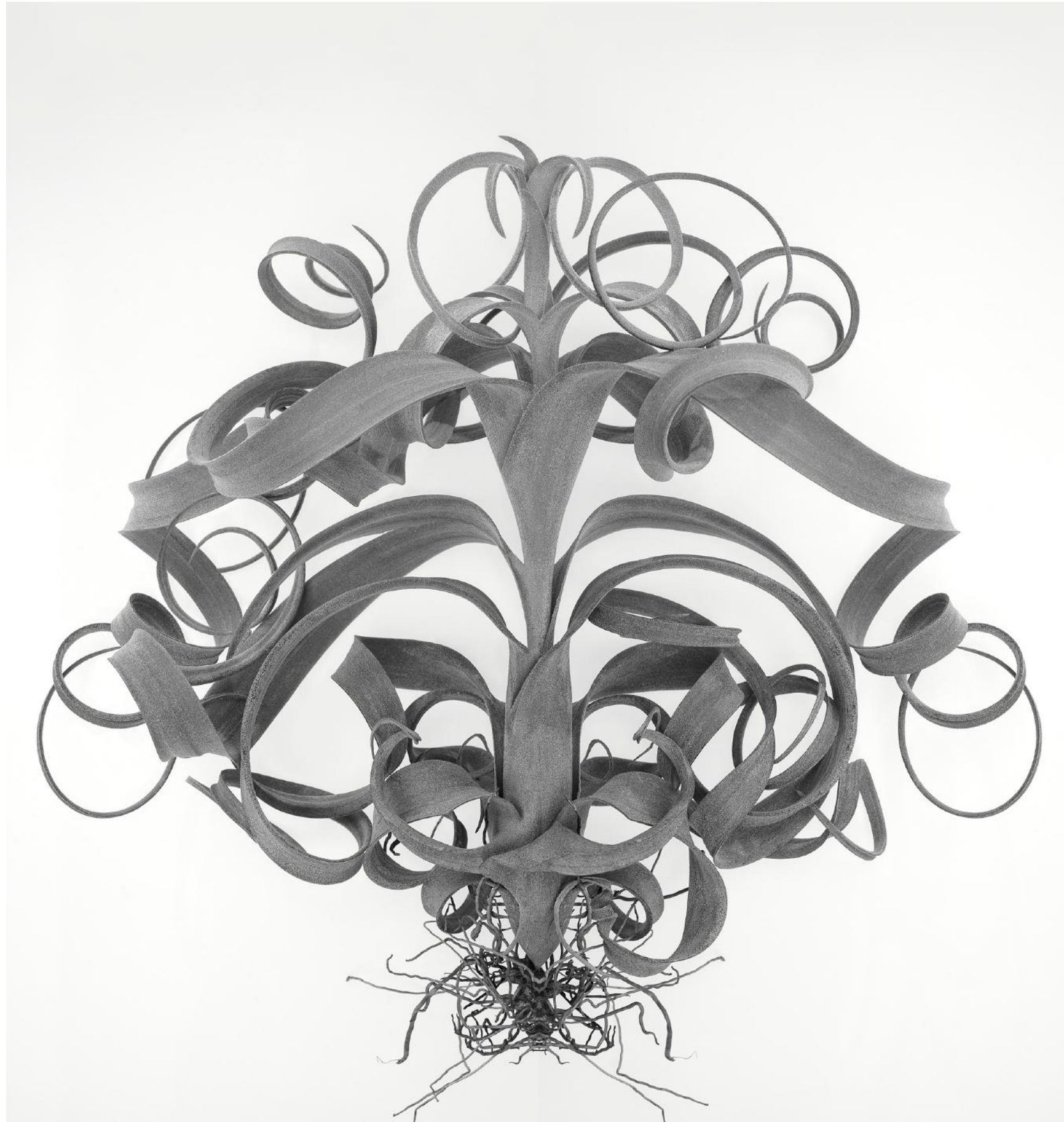
Plant Portrait - Tillandsia 02, 2022 Archival pigment print 39 3/8 x 37 3/8 inches (100 x 95 cm) Edition of 5