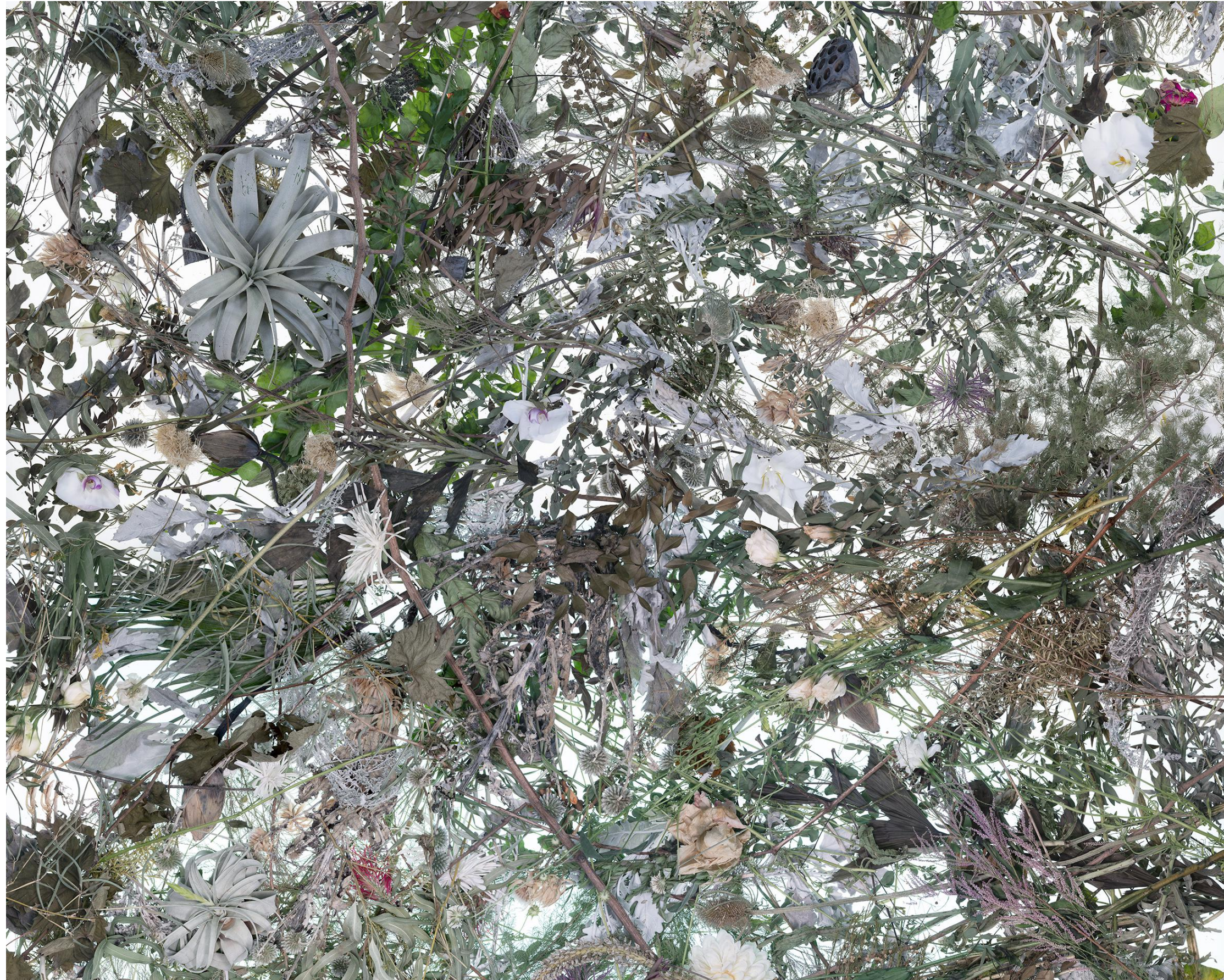
Metempsychosis 2022-1, 2022 Archival pigment print 31 1/2 x 39 3/8 inches (80 x 100 cm) Edition of 5