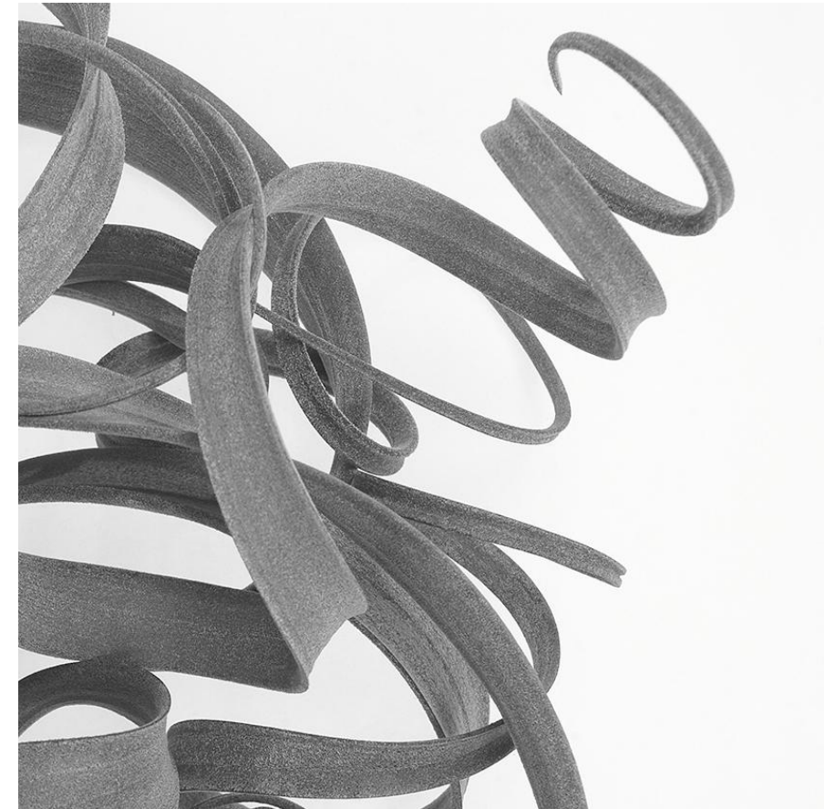
Plant Portrait - Tillandsia 04, 2022 Archival pigment print 39 3/8 x 37 3/8 inches (100 x 95 cm) Edition of 5