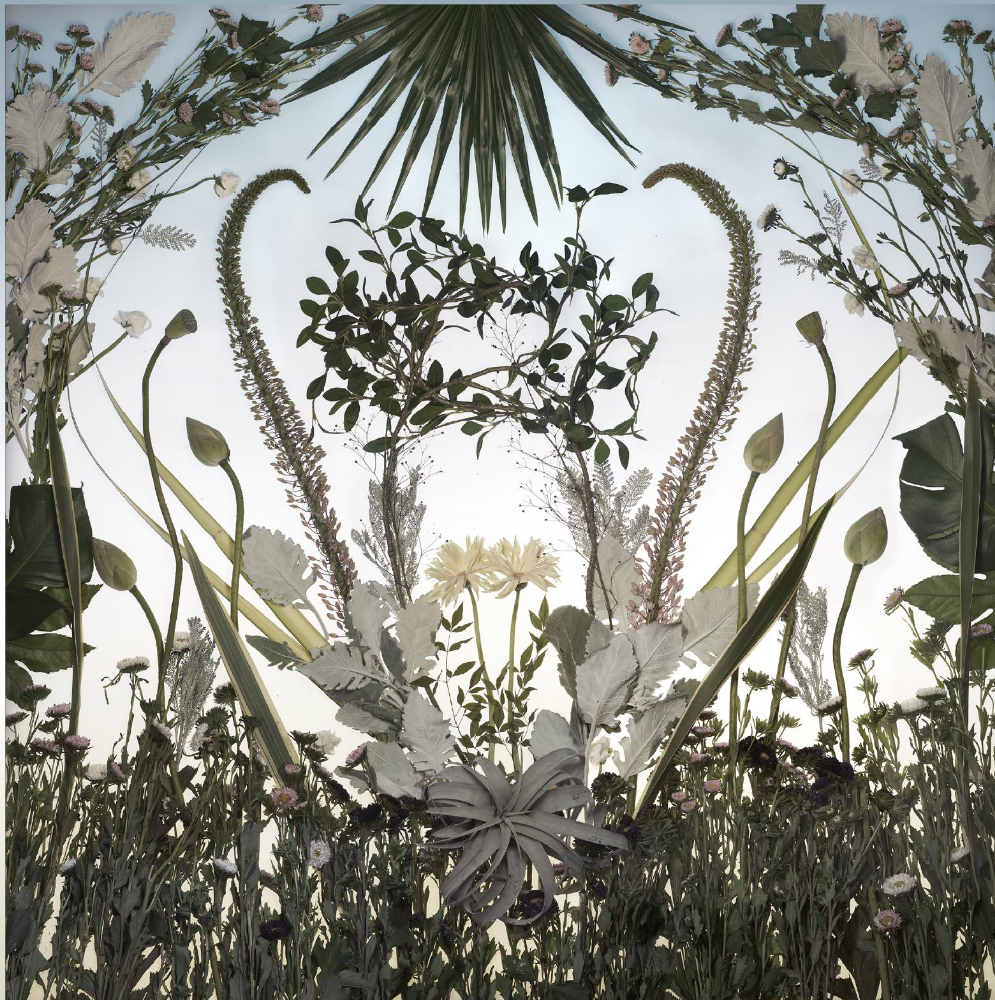
Prosperity, 2021 Archival pigment print 59 x 59 inches (150 x 150 cm) Edition of 3