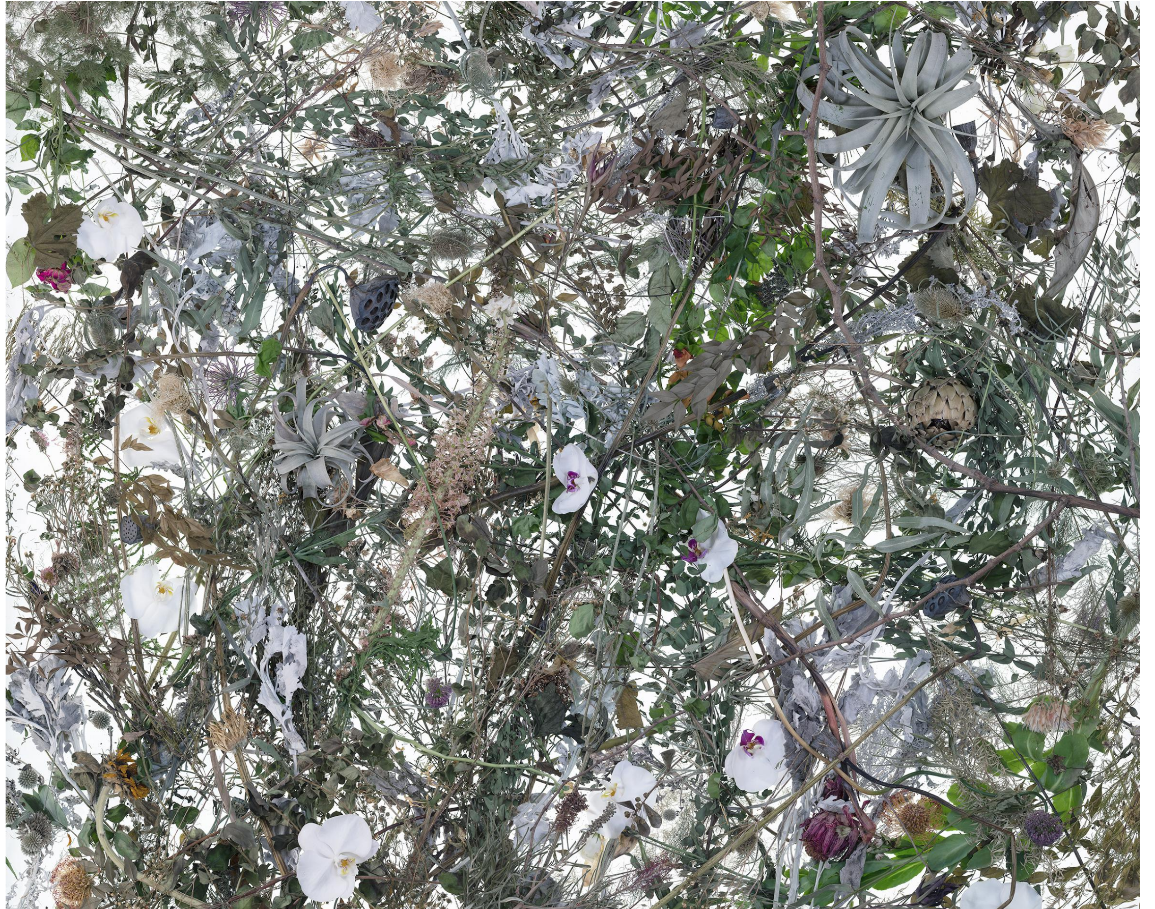
Metempsychosis 2022-2, 2022 Archival pigment print 31 1/2 x 39 3/8 inches (80 x 100 cm) Edition of 5