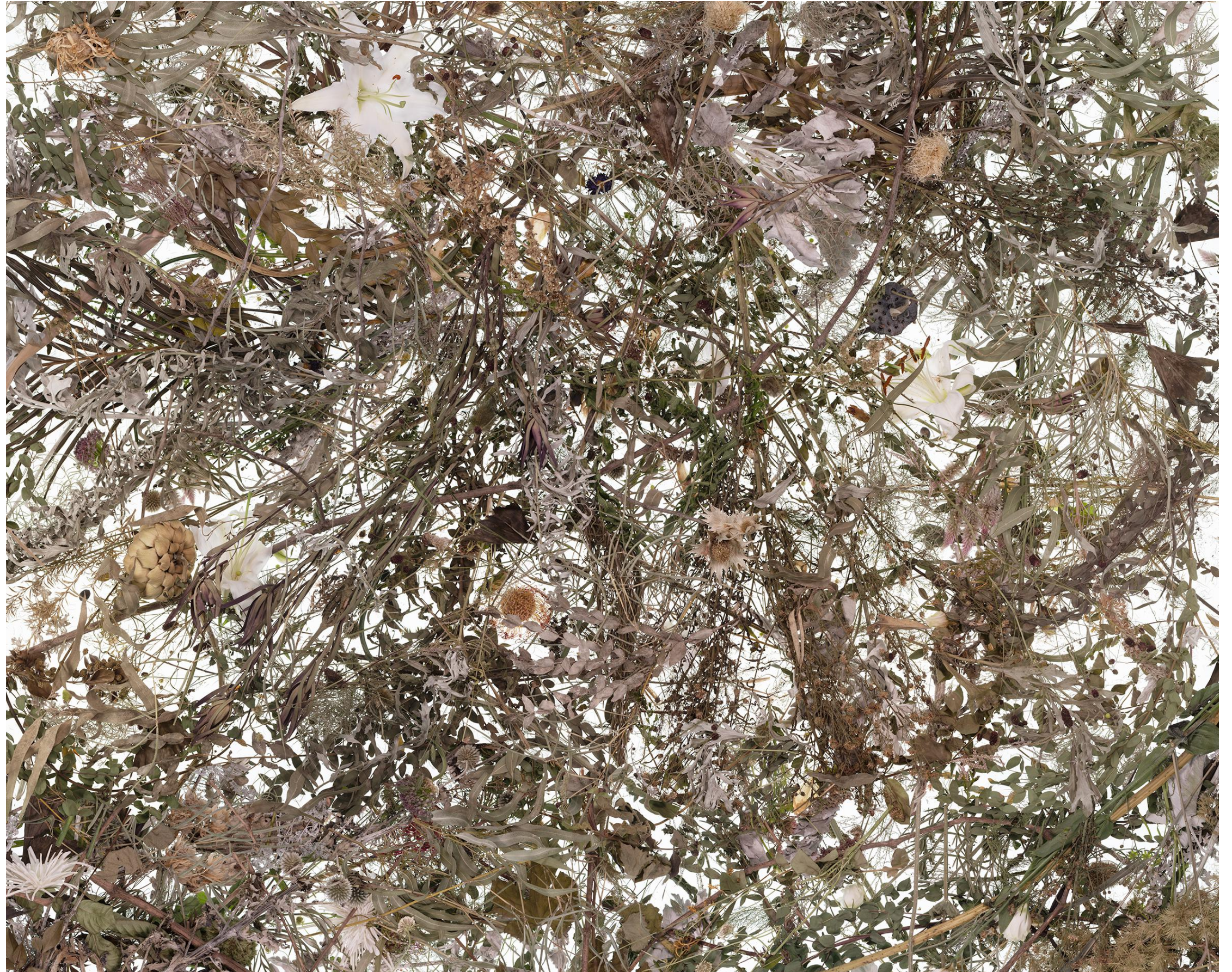
Metempsychosis 2022-4, 2022 Archival pigment print 31 1/2 x 39 3/8 inches (80 x 100 cm) Edition of 5