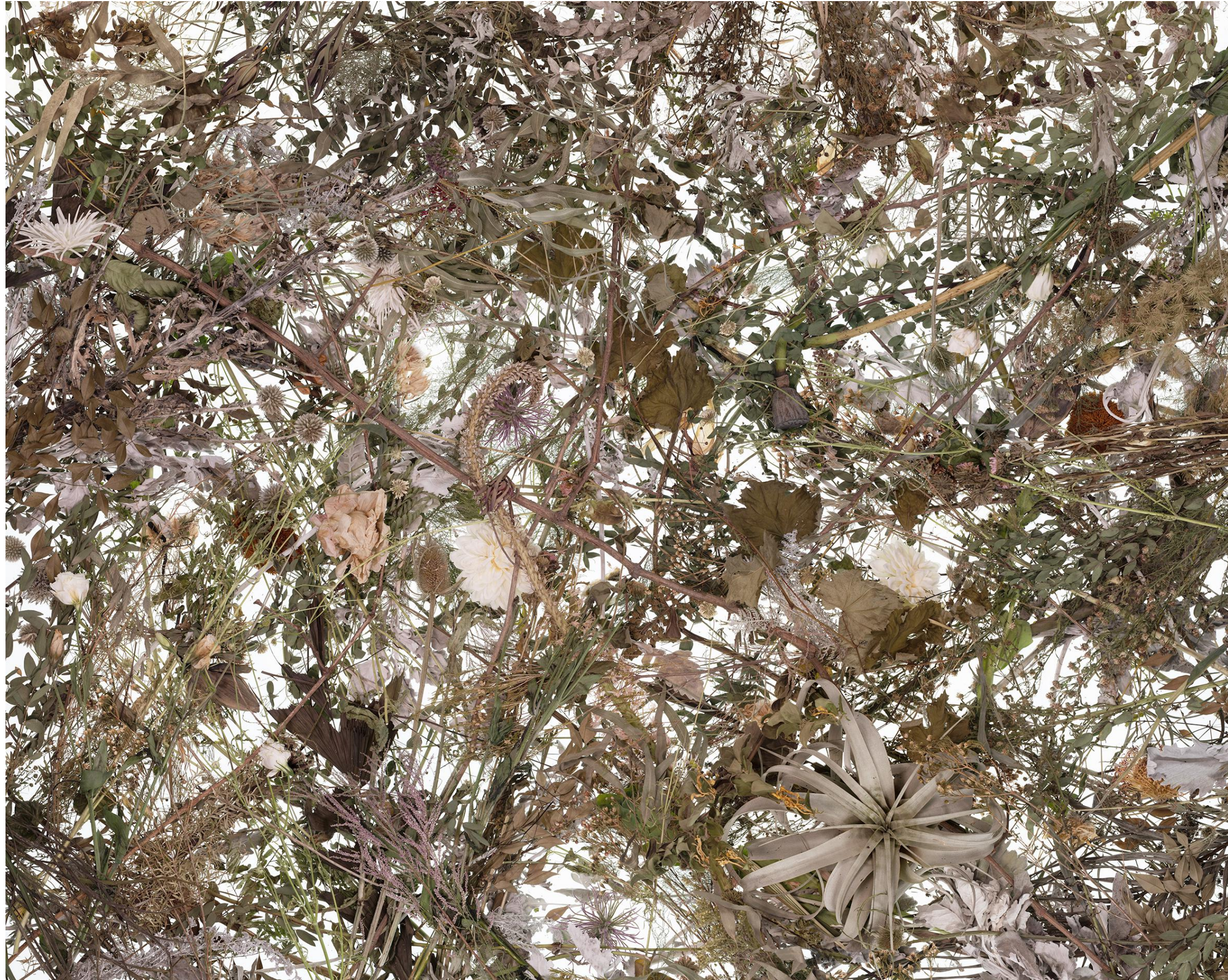
Metempsychosis 2022-3, 2022 Archival pigment print 31 1/2 x 39 3/8 inches (80 x 100 cm) Edition of 5