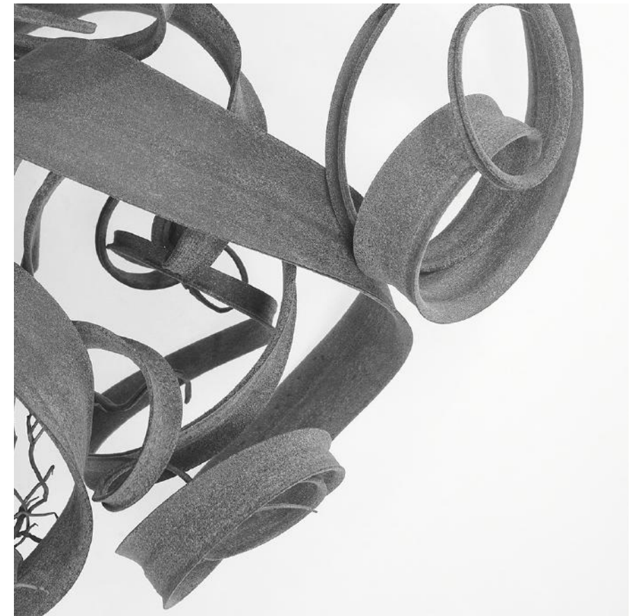
Plant Portrait - Tillandsia 03, 2022 Archival pigment print 39 3/8 x 37 3/8 inches (100 x 95 cm) Edition of 5