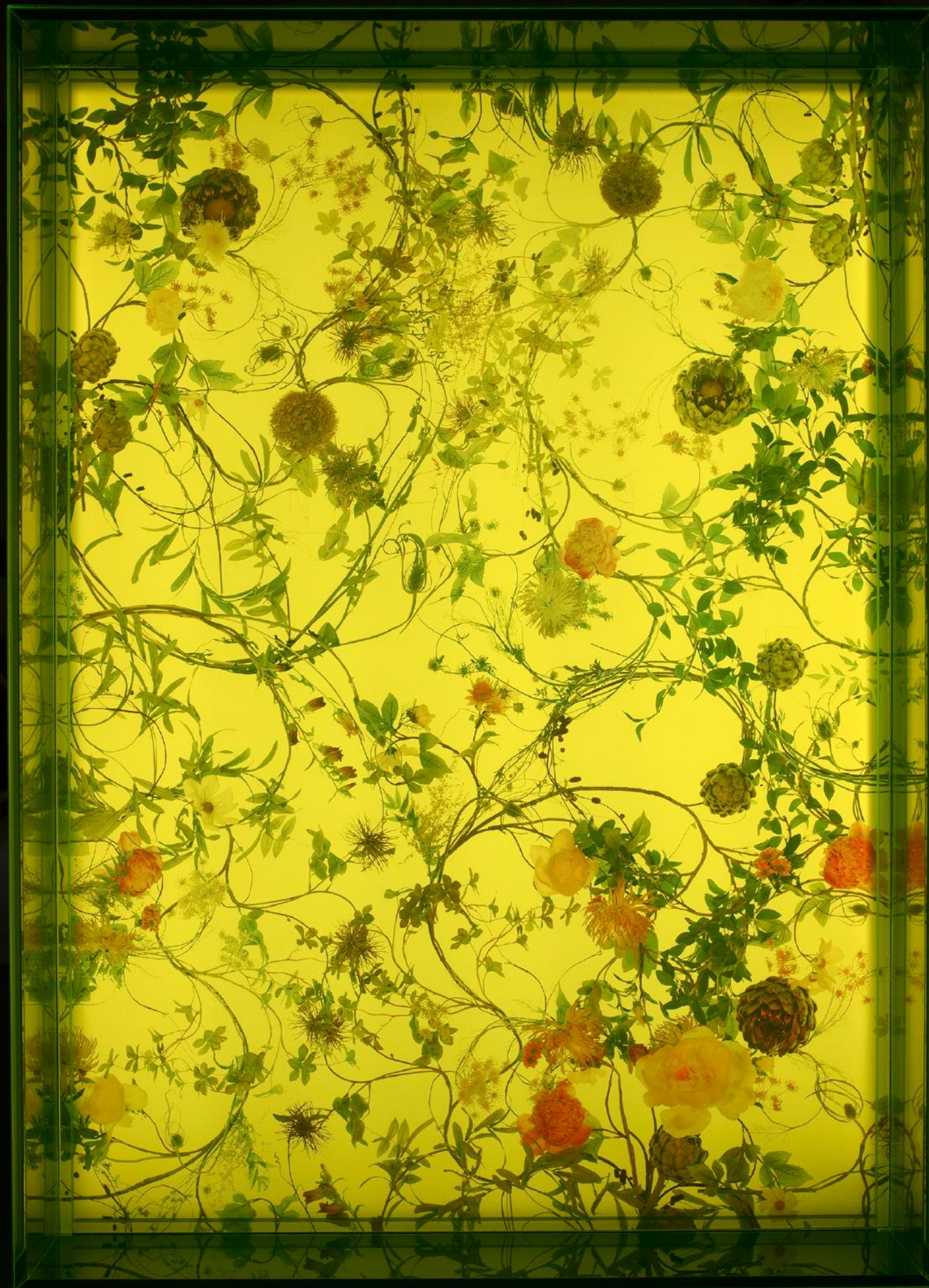
Twining Florets, 2022 Archival pigment print, lightbox 27 1/2 x 19 5/8 x 2 inches (70 x 50 x 5 cm) Edition of 8