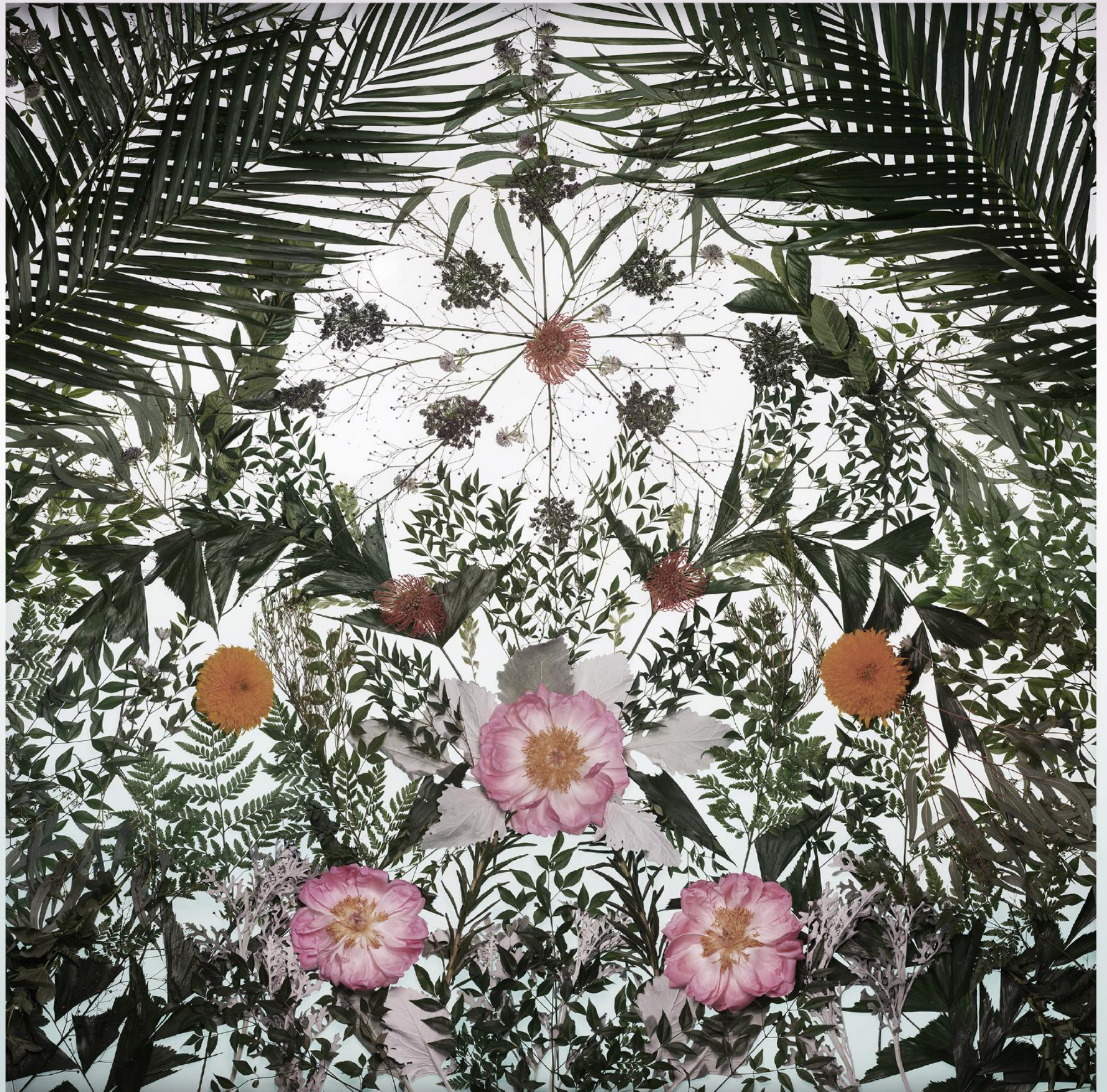
Full Bloom, 2021 Archival pigment print 59 x 59 inches (150 x 150 cm) Edition of 3