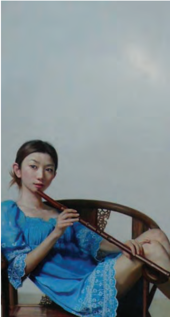
Jiang Huan Goodnight, 2009

For further information, please contact the gallery at (212) 255-4388 or info@ekfineart.com