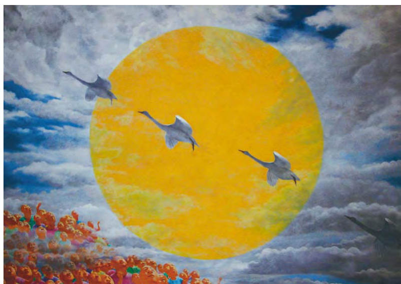
Fang Lijun (方立均) 2006. 5. 1, 2006

New York 纽约 462 West Broadway New York, NY 10012 Tel +1 (212) 255-4388 Fax +1 (212) 255-4316 www.EKfineart.com info@EKfineart.com